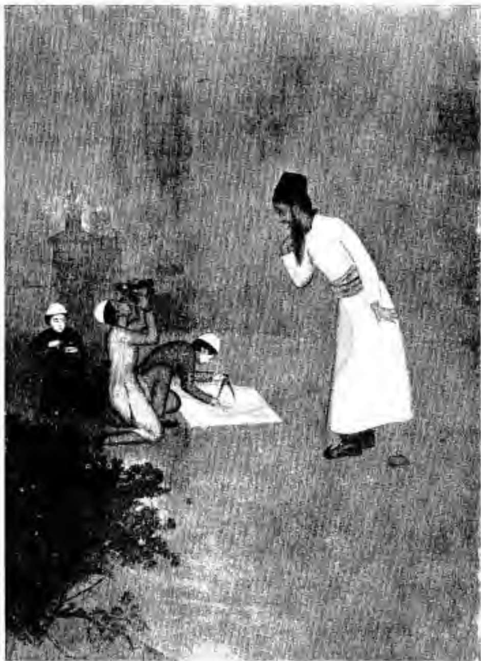
"They made nice calculations."